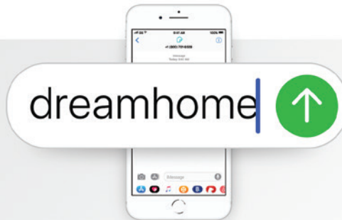
Text-to-Lead Short Codes