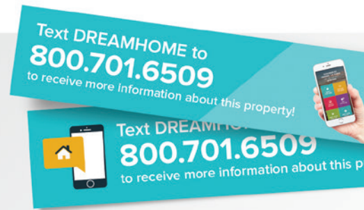
Reusable Sign Riders

Want to take your marketing to the next level? When you pair with a loan officer you'll get access to additional marketing assets like Single Property Websites, Reusable Sign Riders, Text-to-Lead Codes and more!