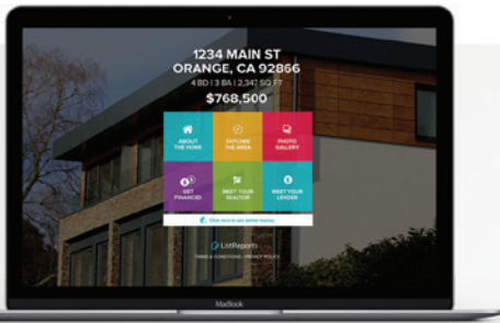
Single Property Websites

Proven lead generation tools built right into your marketing